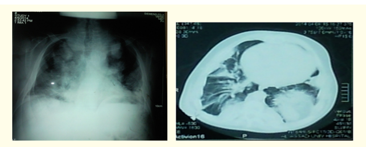
Figure 1: Radiography of thorax, and computed tomography showing bone masses emanating from odds and vertebrae.