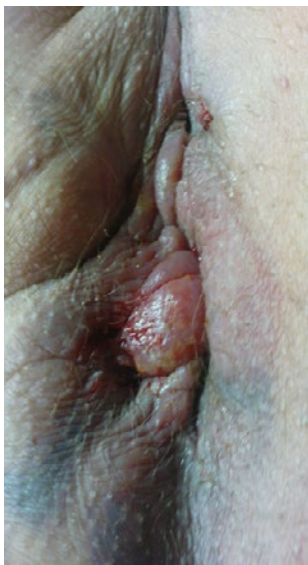
Figure 5. 3 rd day post operatively after removing prolene sutures.

considerable regression in the pain and edema Figure 6, and four weeks later they were seen in OPD and were almost completely pain free without any discomfort in defecation or sitting, and the cushions size have regressed almost completely with normal anal appearance Figure 7 and without bleeding or other serious symptoms.