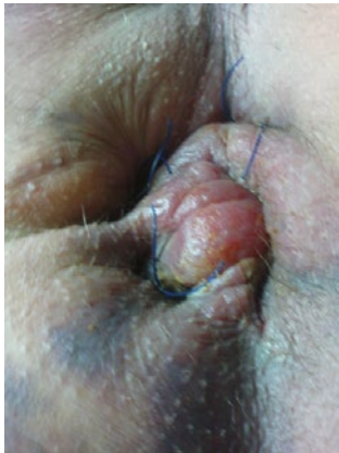
Figure 4. 3 rd day post operatively before removing prolene sutures.