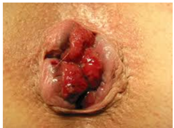
Figure 1. Second degree Hemorrhoids.

The submucosal layer of these cushions contains the vessels mentioned and also rich in muscular fibers, which arise from both the internal sphincter and the conjoined longitudinal muscle. These muscular fibers (the muscularis submucosa) help to maintain