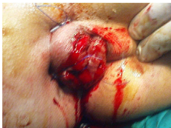
Figure 3. Disconnection of Systemic from Visceral Circulation through the anal canal DSVC.

And the mean procedures time for M&M (20 ± 0) minutes (ranged between 18-35 minutes) and the patient was discharged from the hospital two days post-operation.